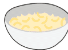
Macaroni & Cheese